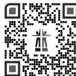
ST. URSULA PARISH