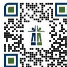
ST. URSULA PARISH