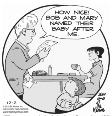
"They named their baby 'Grandma'?"