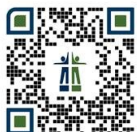
ST. URSULA PARISH