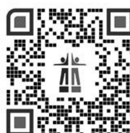
ST. URSULA PARISH