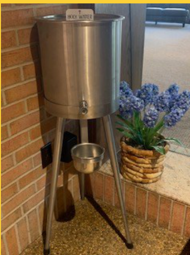
Baptismal Font Bubble Mystery...

We appreciate everyone's cooperation and attention to this request.