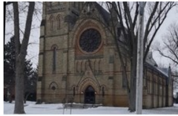
St. Patrick's, Kinkora