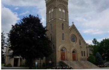
St. Patrick's, Dublin