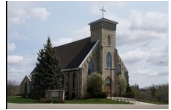
St Vincent de Paul, Mitchell