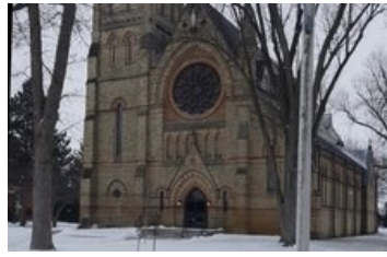
St. Patrick's, Kinkora