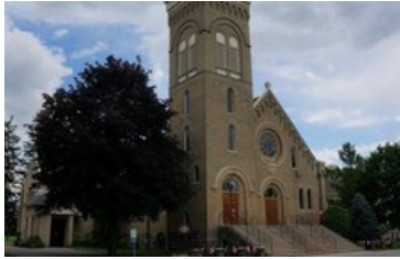
St. Patrick's, Dublin