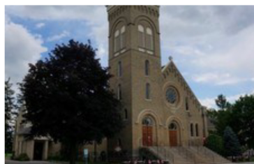
St. Patrick's, Dublin