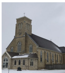
St. James, Seaforth

"The Eucharist invites us to do the work of Jesus compassionately, and meet people where they are at in Perth-Huron Crossroads Catholic Family of Parishes."