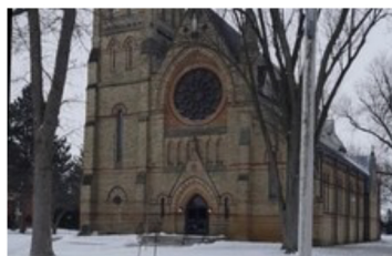
St. Patrick's, Kinkora