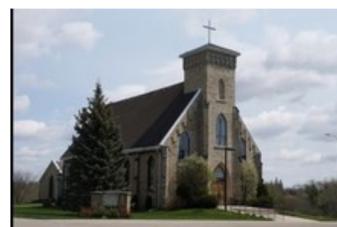
St Vincent de Paul, Mitchell

11th & 12th Sunday of Ordinary Time — June 18 and 25, 2023