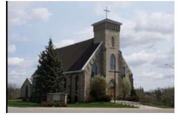
St Vincent de Paul, Mitchell

21st & 22nd Sunday of Ordinary Time — August 27 and September 3, 2023