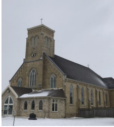
St. James, Seaforth

"The Eucharist invites us to do the work of Jesus compassionately, and meet people where they are at in Perth-Huron Crossroads Catholic Family of Parishes."