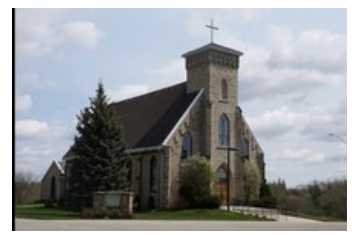
St Vincent de Paul, Mitchell

32nd Sunday of Ordinary Time — November 12, 2023