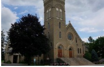
St. Patrick's, Dublin