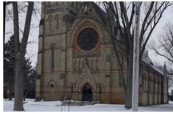
St. Patrick's, Kinkora