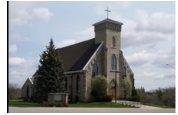
St Vincent de Paul, Mitchell