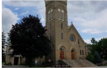
St. Patrick's, Dublin