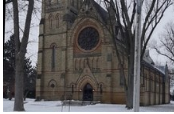
St. Patrick's, Kinkora