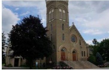
St. Patrick's, Dublin