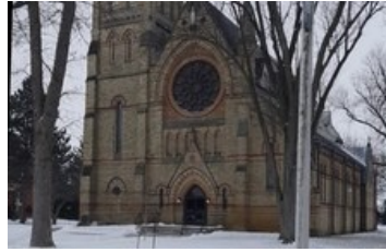
St. Patrick's, Kinkora