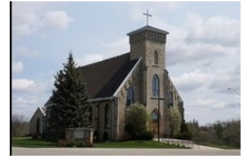
St Vincent de Paul, Mitchell

December 24th, 2023—4th Sunday of Advent—PEACE December 31st, 2023—The Feast of the Holy Family of Jesus, Mary & Joseph