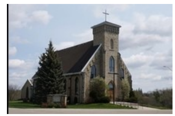
St Vincent de Paul, Mitchell