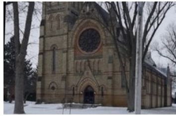
St. Patrick's, Kinkora