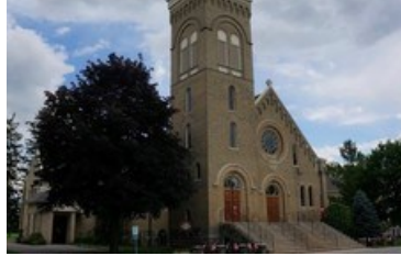
St. Patrick's, Dublin