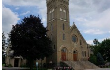
St. Patrick's, Dublin