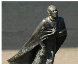
Image of St. Ignatius of Loyola