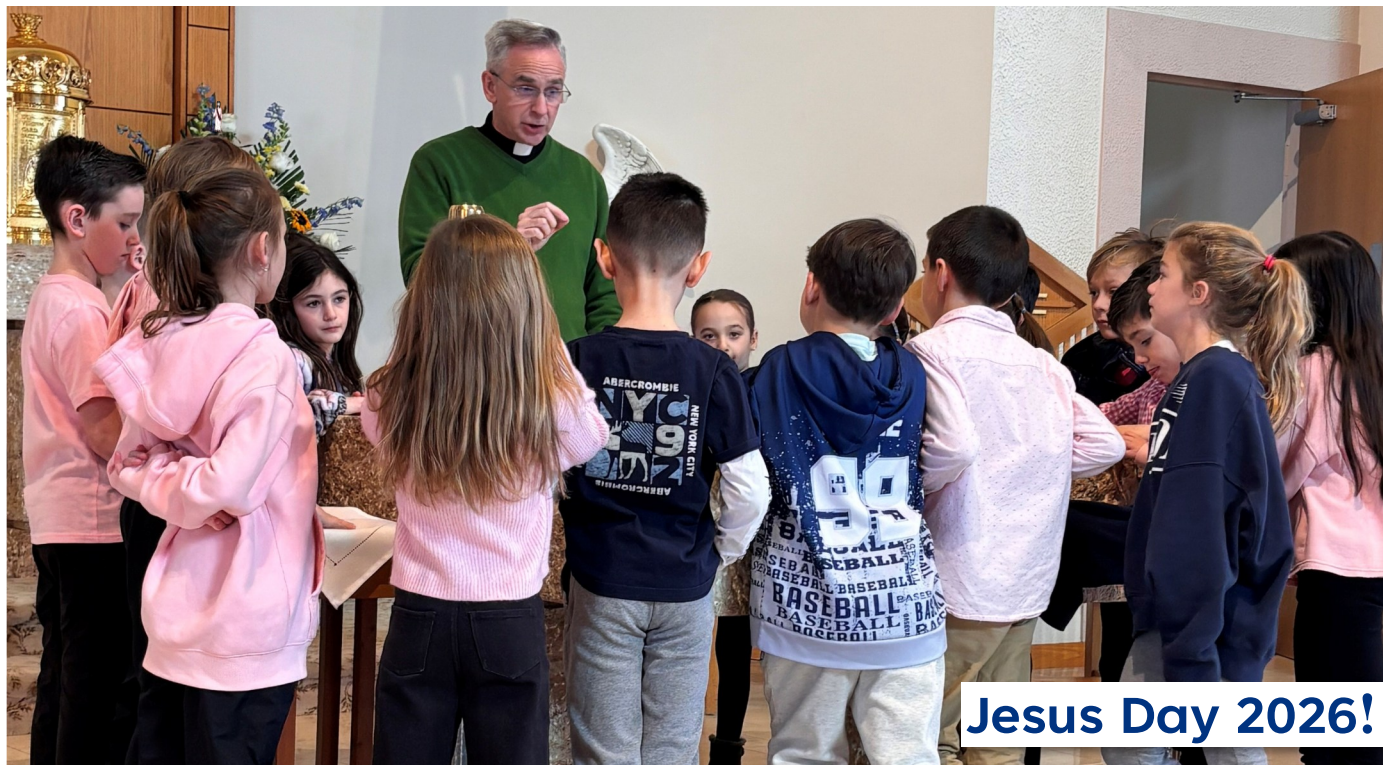
Fifth Sunday in Ordinary Time | February 8, 2026

700 Wyckoff Avenue • Wyckoff • New Jersey • 201• 891• 1122 • www.saintelizabeths.org