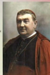
Saint Manuel Gonzales Garcia