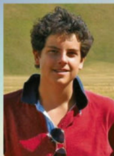
Blessed Carlo Acutis

For those tragically impacted by gun violence, and for the wisdom and grace to reduce it in our local communities and nation.