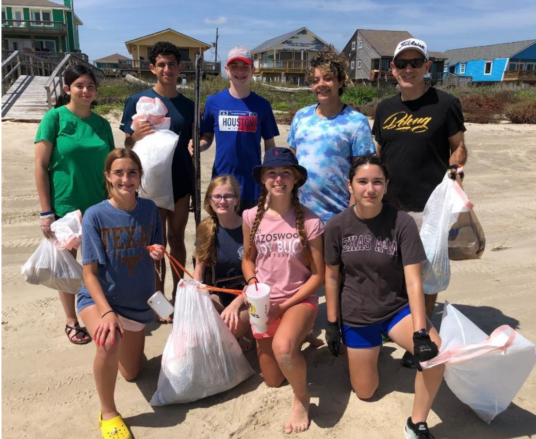
Confirmation Candidate Beach Clean Up