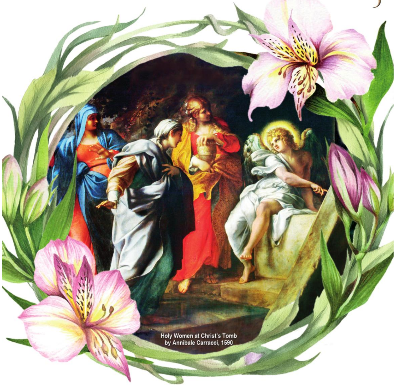
Holy Women at Christ's Tomb by Annibale Carracci, 1590

“Why do you seek the living one among the dead? He is not here, but he has been raised. ”