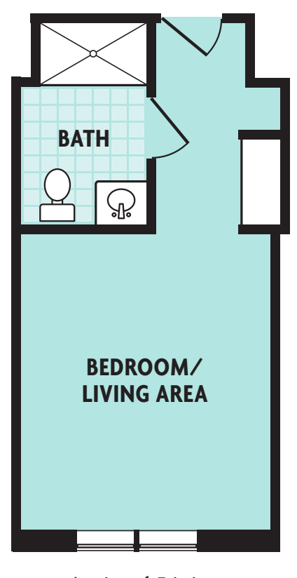
Assisted Living Apartment