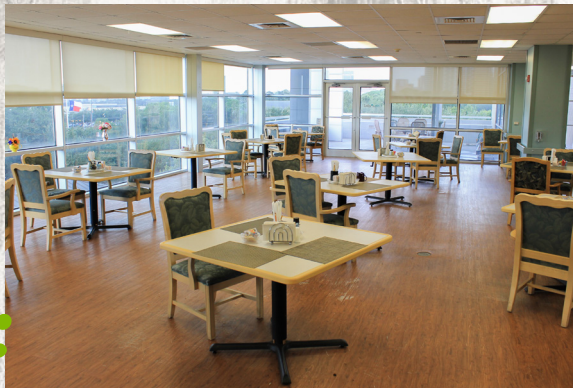
Assisted Living Dining Room

This Holiday Season, help us give our residents the gift of upgraded common areas!