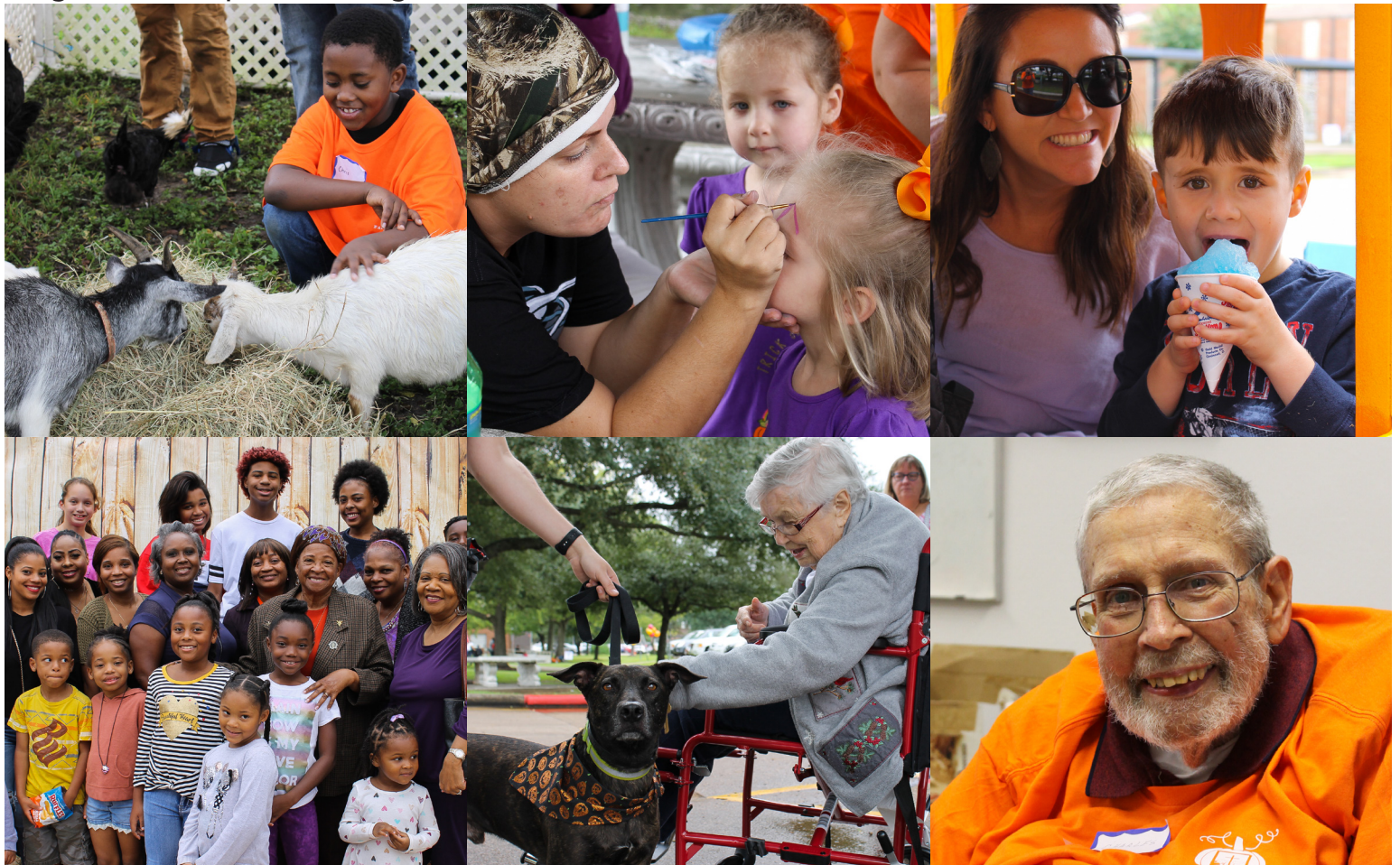
Residents and their families enjoying themselves at the Fall Festival.