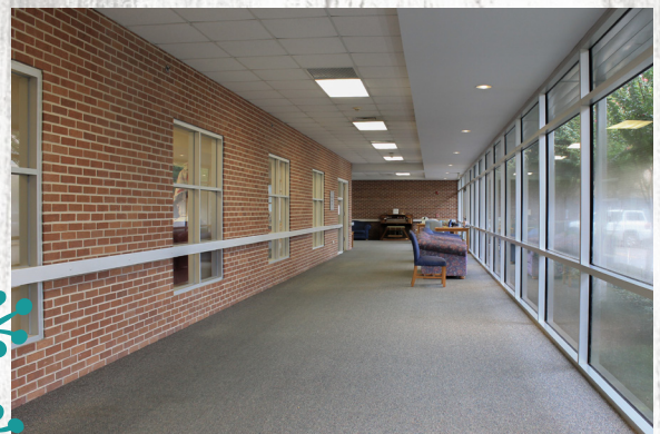
The "Link" Area

A gift as little as $25 can go a long way to ensure the comfort of those who spend time in the Assisted Living Dining Room and Link Area.