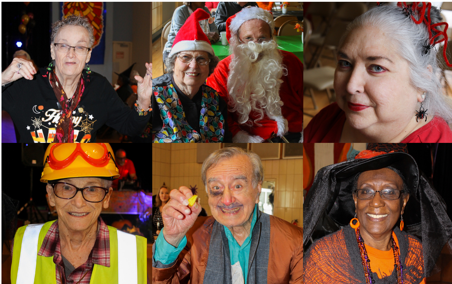
Residents and family members enjoying the Halloween Dance.

"Caring for Our Elders with the Compassion of Christ"