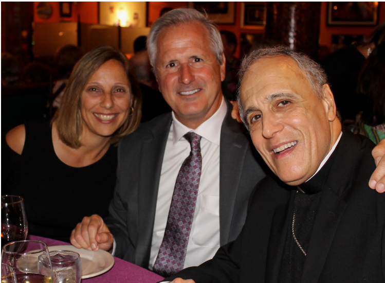
Guests with Cardinal DiNardo