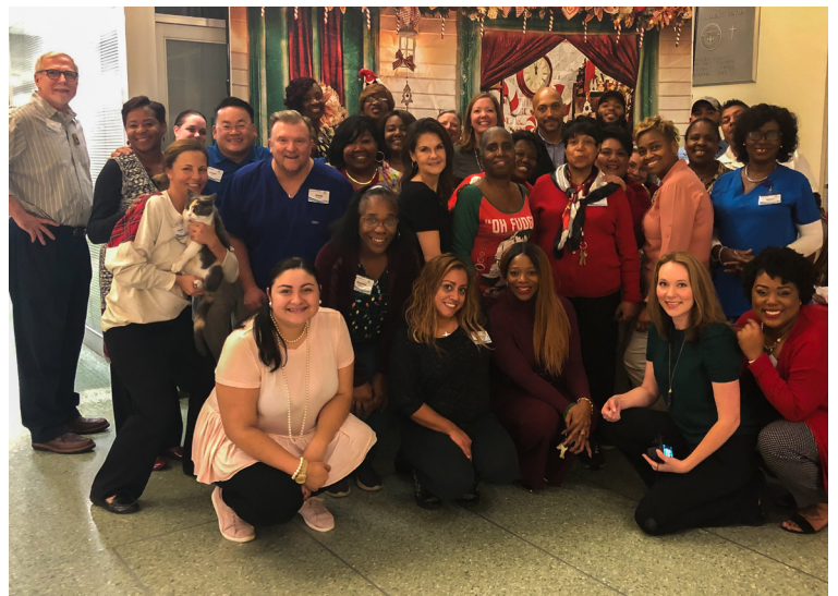
St. Dominic Village Staff