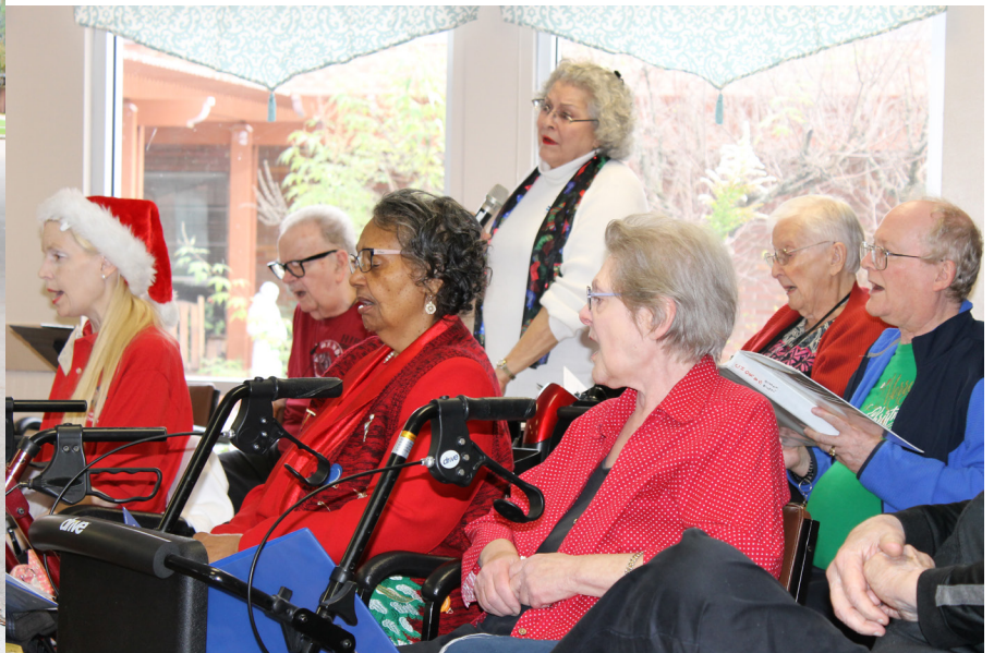
The SDV Choir put on the performance of a lifetime for our RNC residents this past Holiday Season.