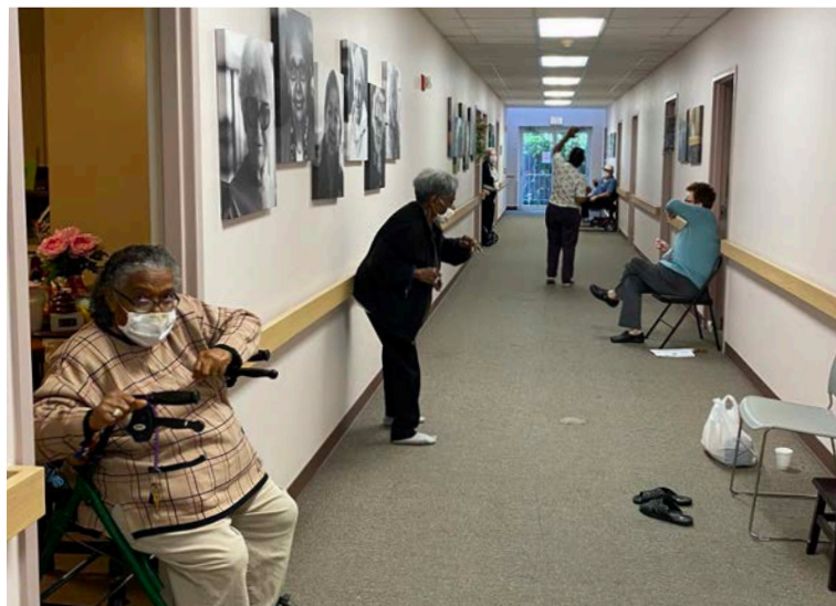
Hallway dance party!