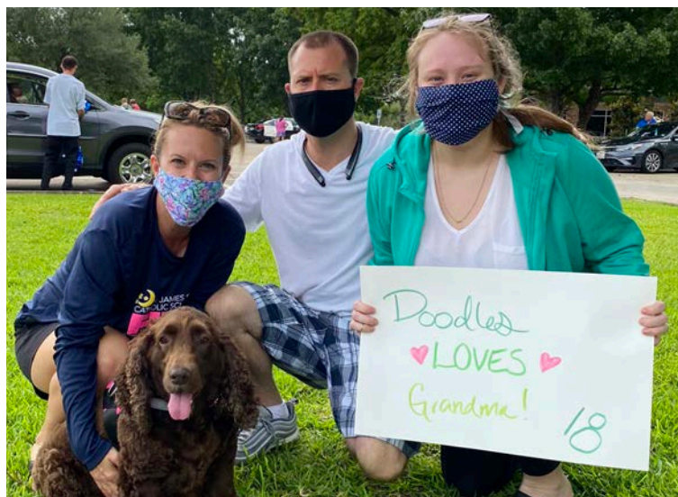
Furry friend, Doodles, was happy to see Grandma. 9 • St. Dominic Village | Summer 2020