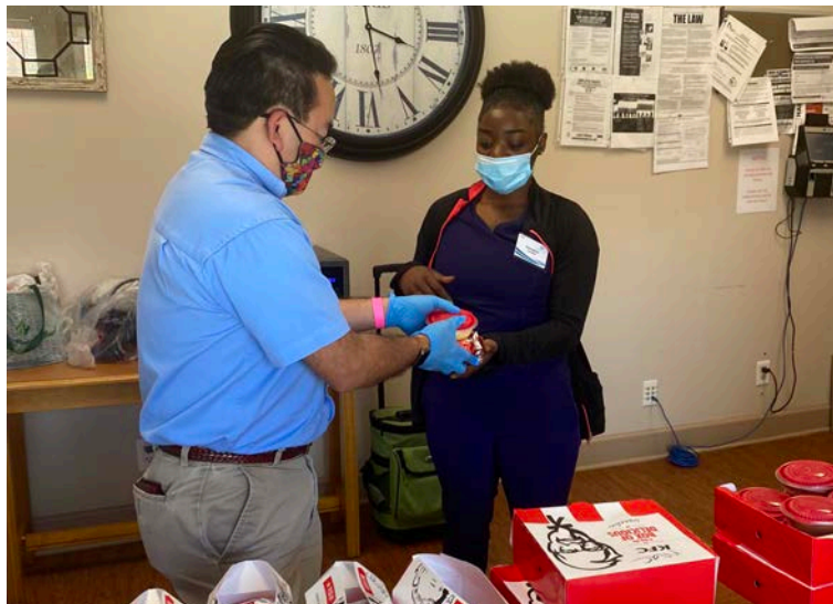
HR Director, Docker, distributing meals during nurses week.