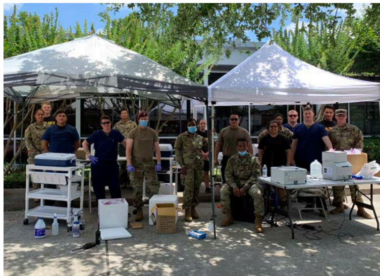
National Guard soldiers tested everyone on campus.