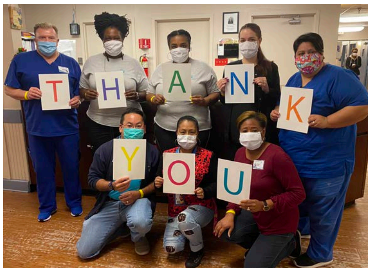
Nursing and administrative staff.

This year, employee appreciation took on a whole new meaning. From May 6 - May 12, we celebrated National Nurses Week by providing our nursing staff with cake, ice cream, and other delicious treats. Then, from June 18 - June 25 we provided box lunches and snacks to our CNAs and CMAs for National Nursing Assistants Week.