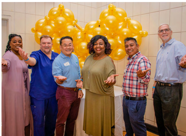
SDV Senior Management Staff.