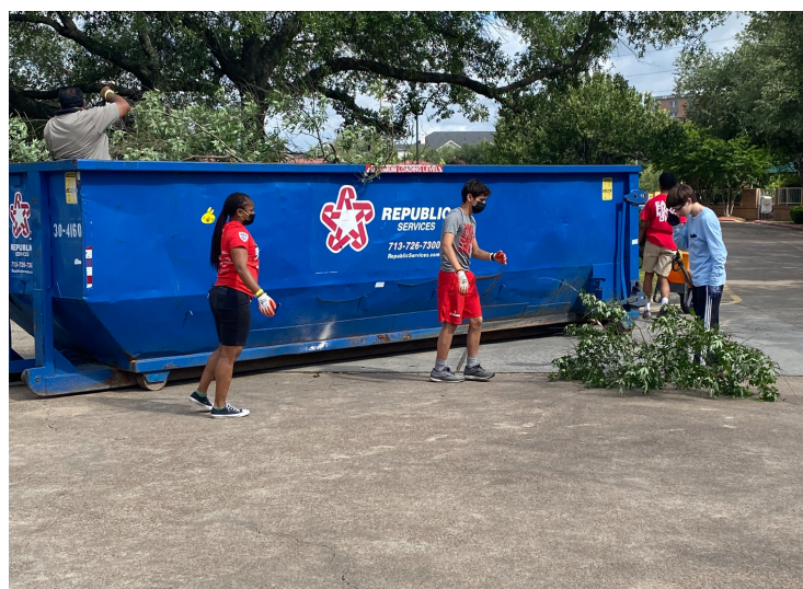
St. Thomas High School students and staff volunteering.