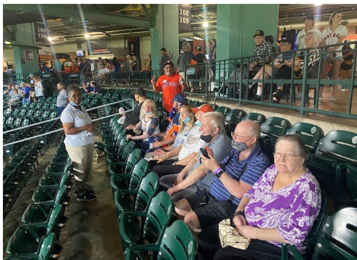
Residents and staff waiting for the Astros game to begin.