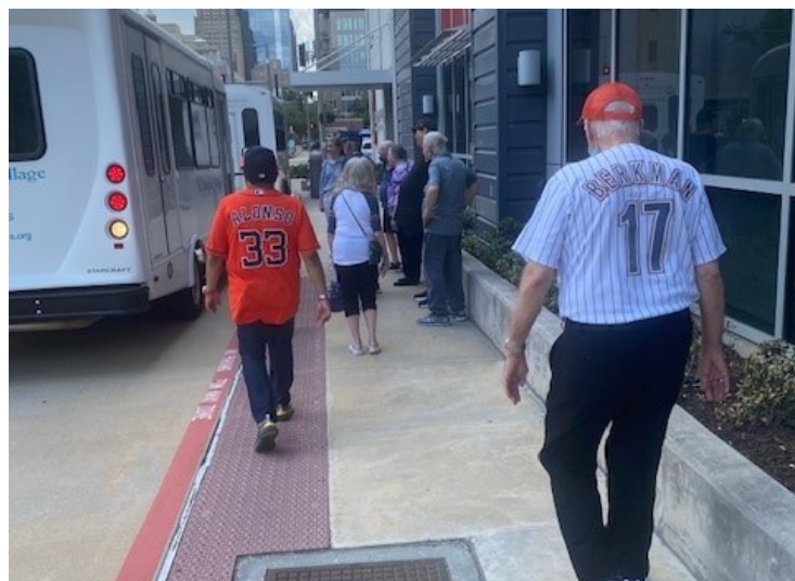
AL and IL residents boarding the bus after attending an Astros game.