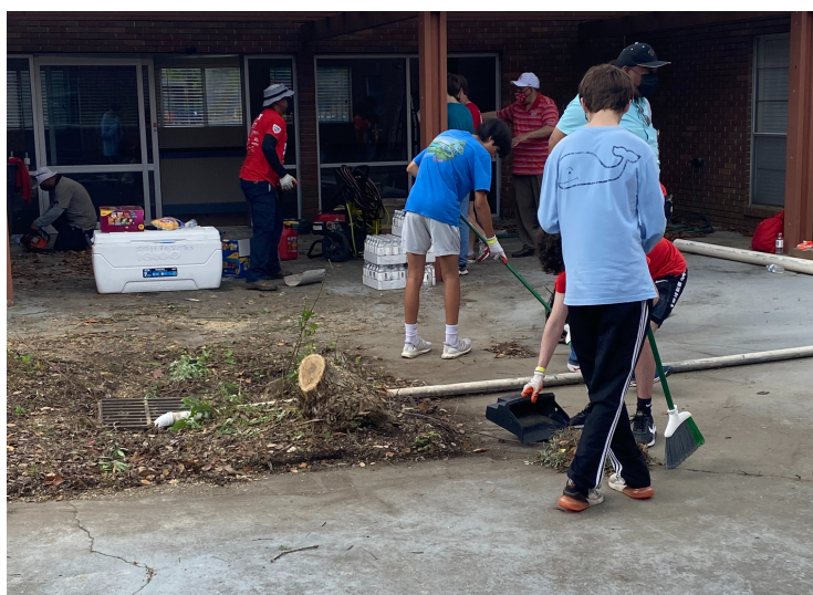
St. Thomas High School students cleaning up the RNC patio.