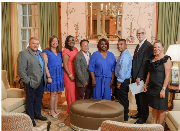
St. Dominic Village Senior Staff.