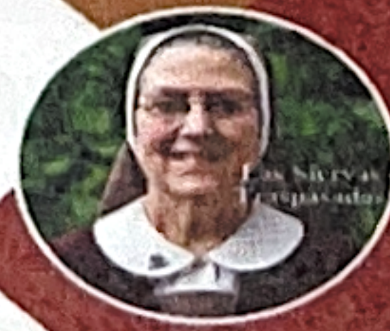
Las Siervas de los Corazones Traspasados de Jesús y María