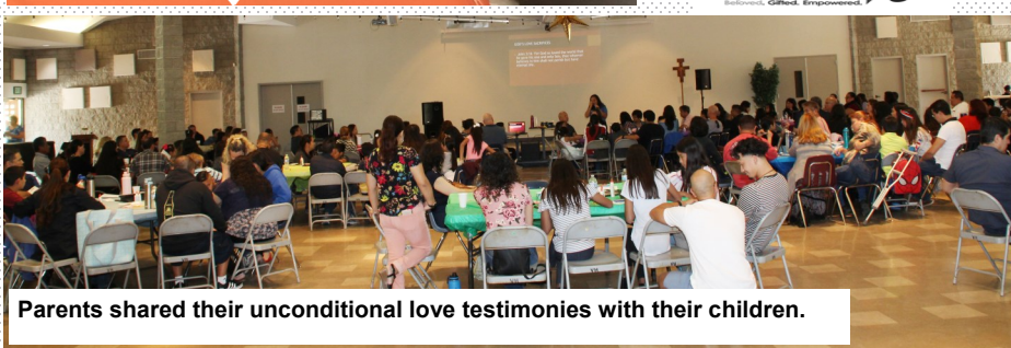
Parents shared their unconditional love testimonies with their children.