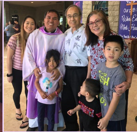
B A R R E D O F A M I L Y