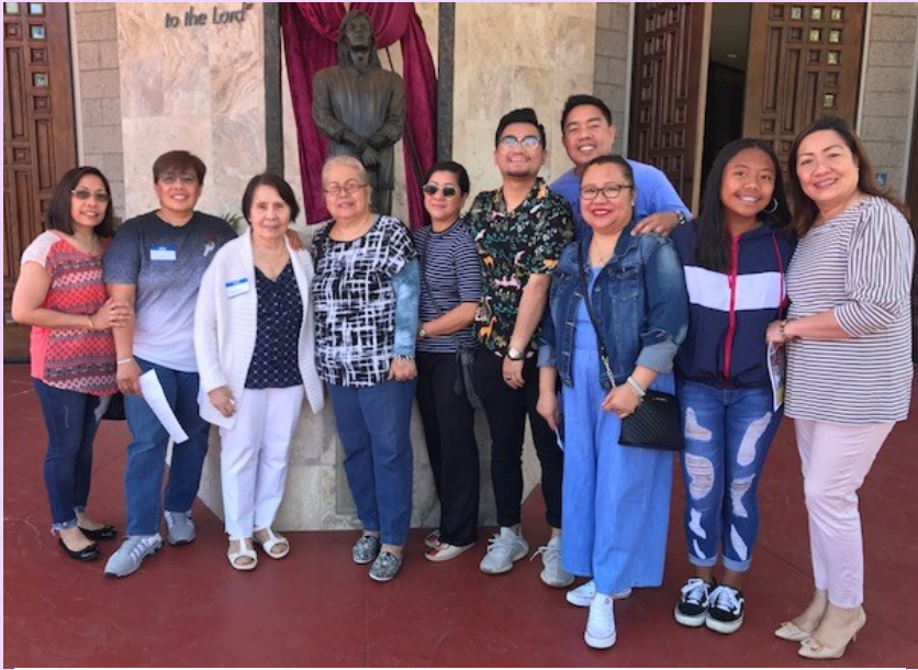
Family day begins with church together ....(taken after the 10:30 Mass)