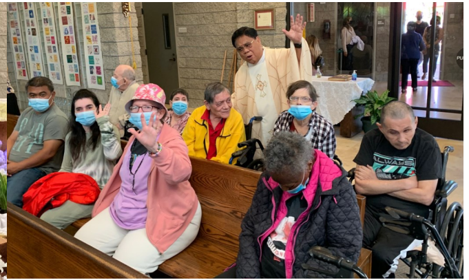
Welcome Home to our friends at the 10:30am Mass !