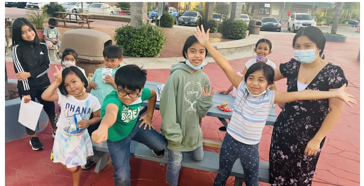
Our angels in rehearsal....

We cannot thank you enough— you are the best!