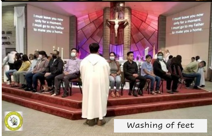
Washing of feet