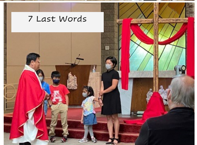
7 Last Words