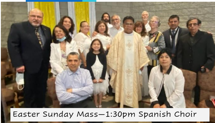
Easter Sunday Mass—1:30pm Spanish Choir