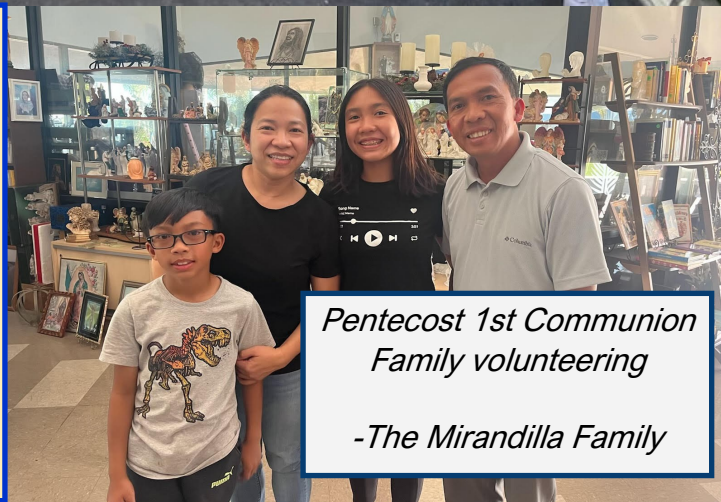
Pentecost 1st Communion Family volunteering

Bring the Spiritual Bouquet envelope to the Parish Office, and bring your card home for your loved ones.