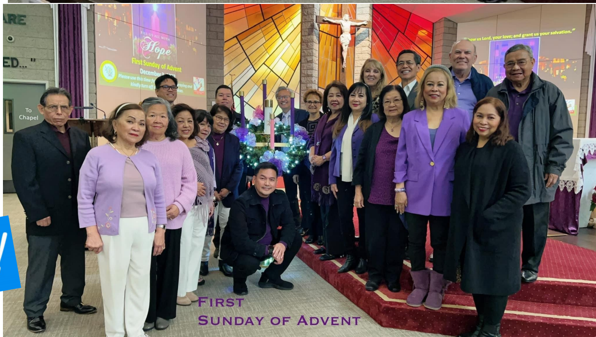
FIRST SUNDAY OF ADVENT