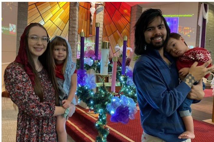
Lighting the Advent Wreath 7:30am and 9:00am masses