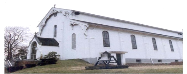
St. Aloysius Church 64 Church St., PO Box 542 Gilbertville, MA 01031