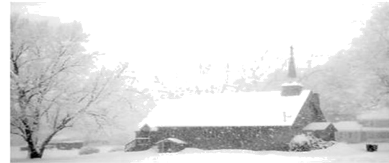
St. Augustine Mission 98 Church Lane Wheelwright, MA 01094