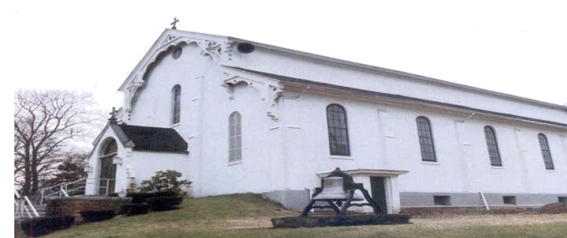
St. Aloysius Church 64 Church St., PO Box 542 Gilbertville, MA 01031