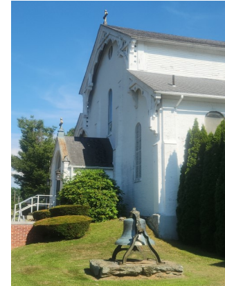
St. Aloysius Church 64 Church St. P.O. Box 542 Gilbertville, MA 01031