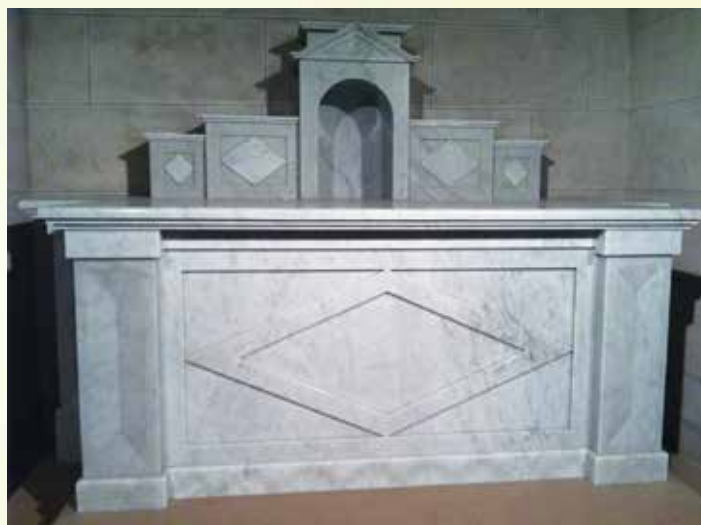
Tomb of Fr Mermier