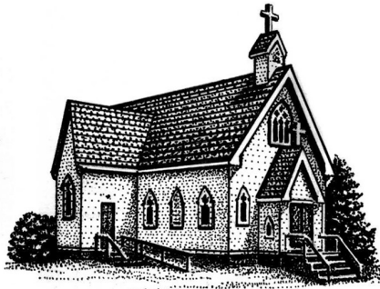
St. Timothy—Campobello Isle, NB