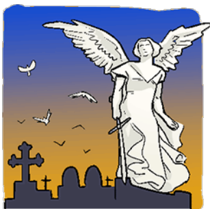
All Souls' Day