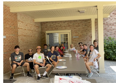
Participants during the Youth Group Service Week