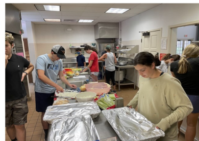
Cooking a meal to feed 200 at the Norwalk Soup Kitchen