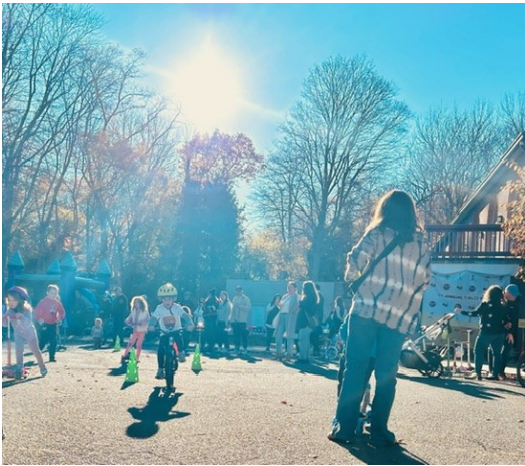
Turkey Trot/Bike a Thon!