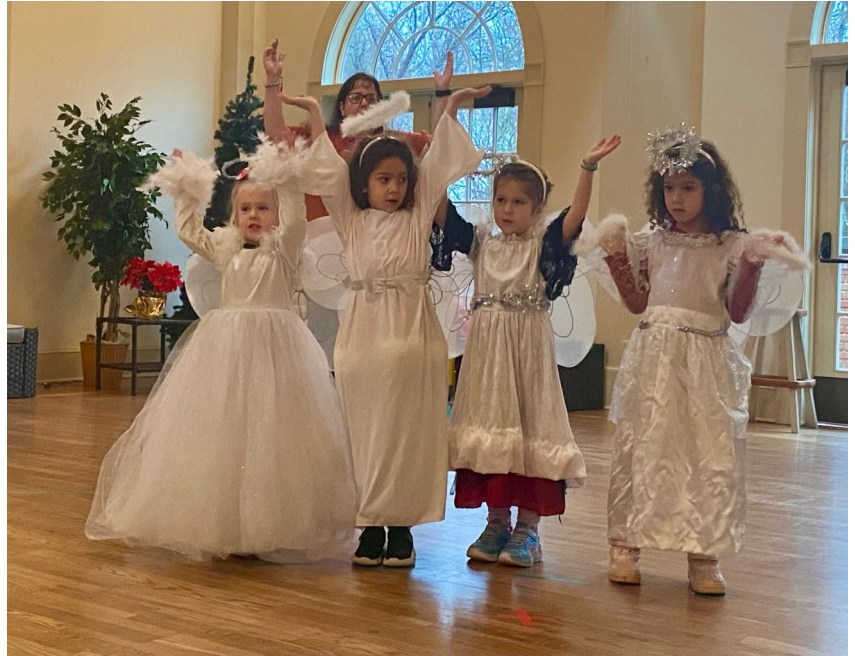
Angels celebrating, "Glory to God in the Highest"