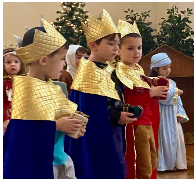
The Three Wise Men bearing gifts

Our In House Registration for the 2025/26 school year begins Jan. 6th. We will open it to the public after Jan. 15th, so please let us know your intentions for the upcoming school year.