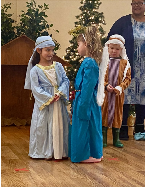
Mary and the Angel Gabriel & Joseph

Our SFA Annual Christmas Story Pageant was a beautiful celebration of the true meaning of Christmas! The children and teachers worked so hard to make it a memorable morning for all of our families and spectators. We wish you all a blessed Christmas and a Happy, Healthy New Year!