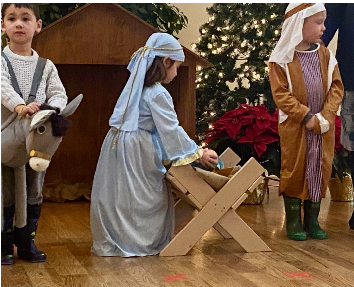
Mary laying Baby Jesus in the manger