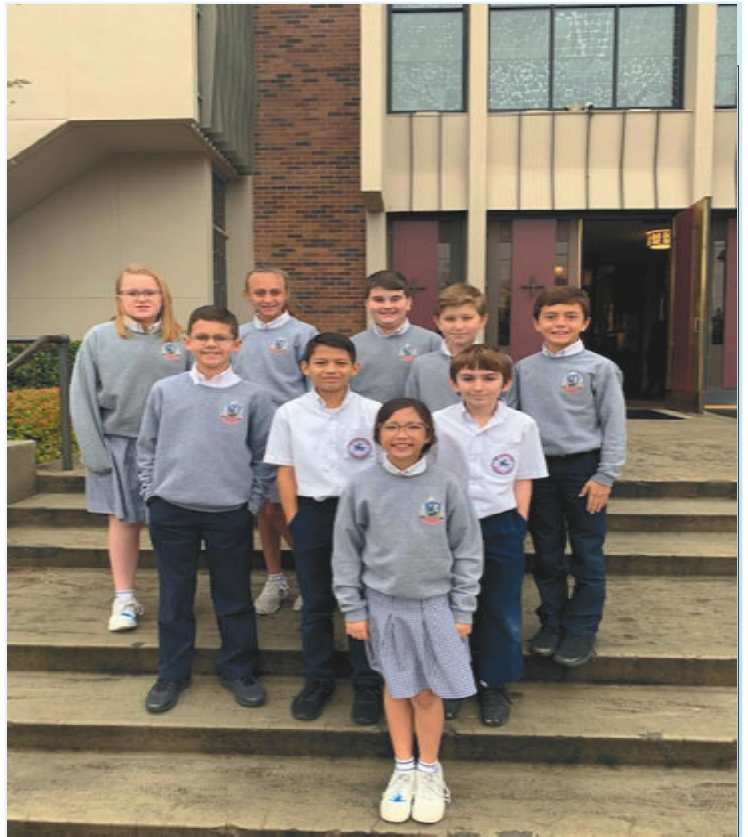
Some of our altar servers recently represented SJA at the regional mass for Catholic Schools Week.