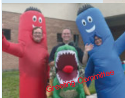
WE DID IT!