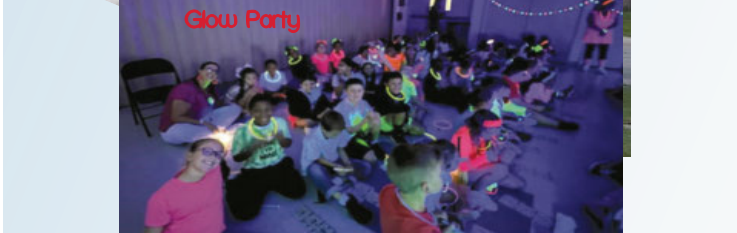
Popcorn & a movie