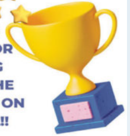
Boostertthon kick off