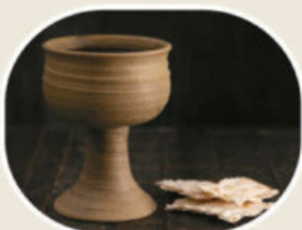
DO THIS IN MEMORY OF ME LUKE 22:19

CONGRATULATIONS TO OUR 2 ND GRADERS WHO RECENTLY MADE THEIR FIRST COMMUNION.