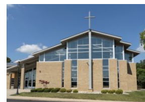
St. Thomas More Catholic Student Parish 421 Monroe St., Kalamazoo

March 24 Palm Sunday of the Passion of the Lord Saturday 6:00 p.m. Sunday 8:30 a.m.; 10:30 a.m.; 6:00 p.m. Passion Play at all Masses