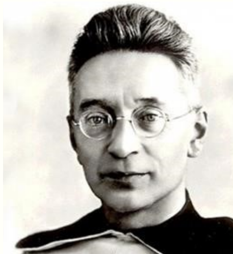
Bl. Titus Brandsma

"I can't help it that in all things God gives witness to himself"