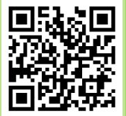
This is a QR-Code (Quick Response Code)

Visit osvhub.com/fatimachurchabq/funds to see how easy it is! You can also use your smartphone to take a picture of the QR Code on the right and it will automatically link to the web address.