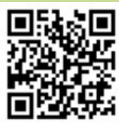
This is a QR-Code (Quick Response Code)

*If you have become a recurring donor and do not wish to receive paper envelopes through the mail please call the parish office at #505-265-5868.